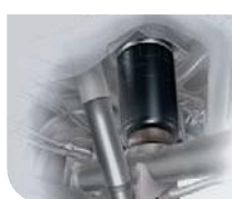
Full Air Suspension

Drive-Rite air helper springs can be installed on most light commercial vehicles, motorhomes, vans and SUVs. Systems available for both leaf and coil spring applications. The double convoluted and tapered sleeve air springs offer comfort, maximum load support as well as years of worry-free service under any load condition.