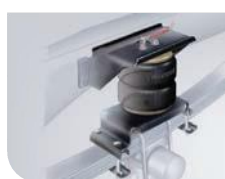
Semi Air Suspension

Drive-Rite air helper springs can be installed on most light commercial vehicles, motorhomes, vans and SUVs. Systems available for both leaf and coil spring applications. The double convoluted and tapered sleeve air springs offer comfort, maximum load support as well as years of worry-free service under any load condition.